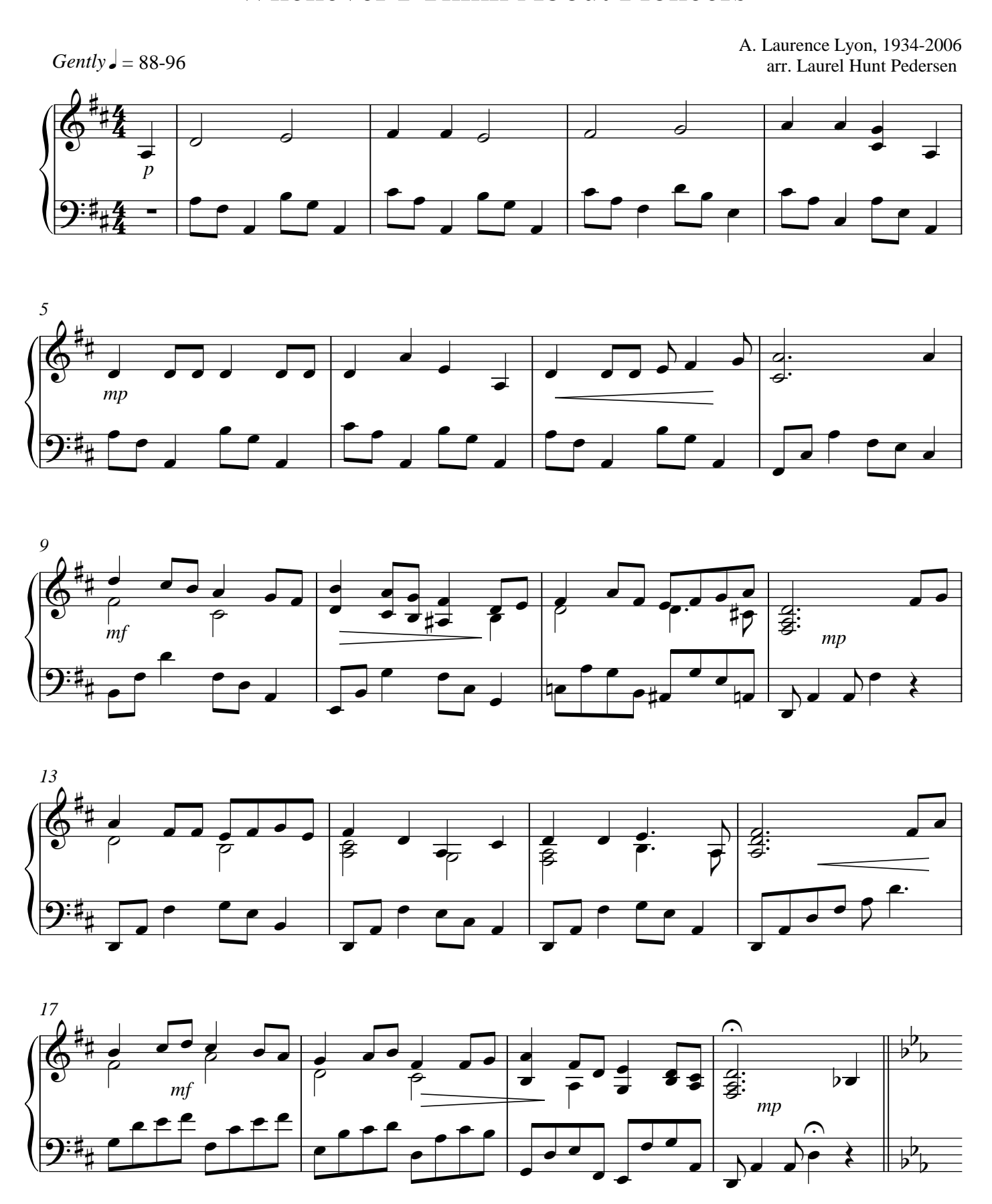
Copyright © 2014 Laurel Hunt Pedersen